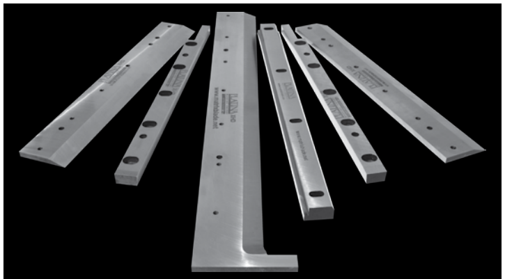
SADDLE STITCHER KNIVES