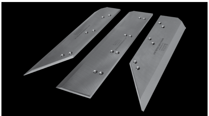
3 KNIFE TRIMMERS